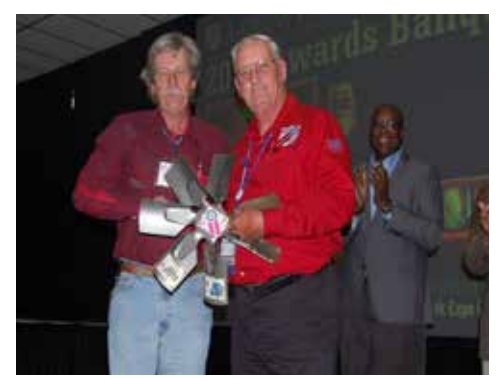
Flashback! 2015 Awards Banquet in York, PA:, Hand-off of the ATHS fan signifying new leadership of where the next National Convention will be held...

We are kicking off the 2024 Convention with a big ole' party! Join us for food, fun, and friends!